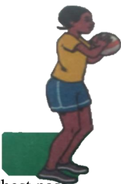
a. Chest pass

19. Identify the type of pass demonstrated below. (3 mks)