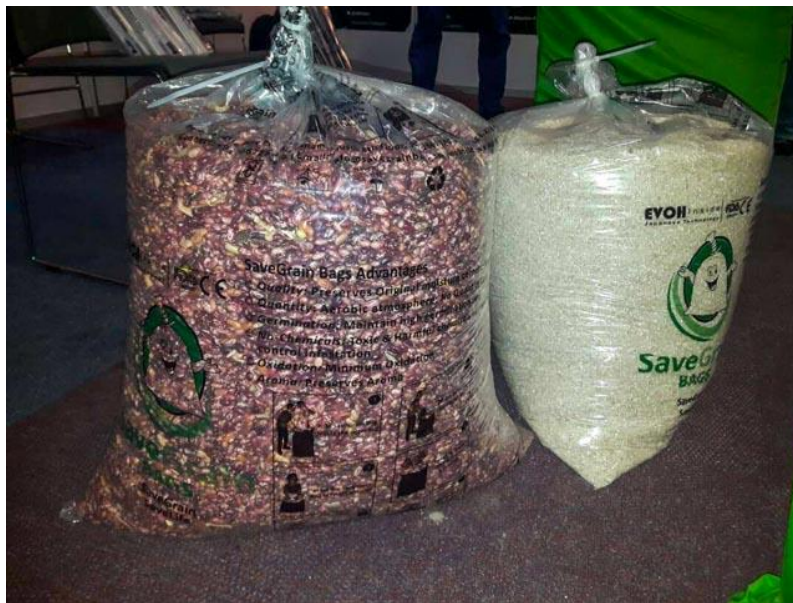
Hermetic Bags by Save Grain Bags

A post-harvest storage technology, Hermetic storage protects grain by creating an oxygen-deficient and carbon dioxide-rich atmosphere that is incompatible with the survival or breeding of pests. It creates an airtight and moisture-tight barrier, preserving the agricultural products in their optimal form.