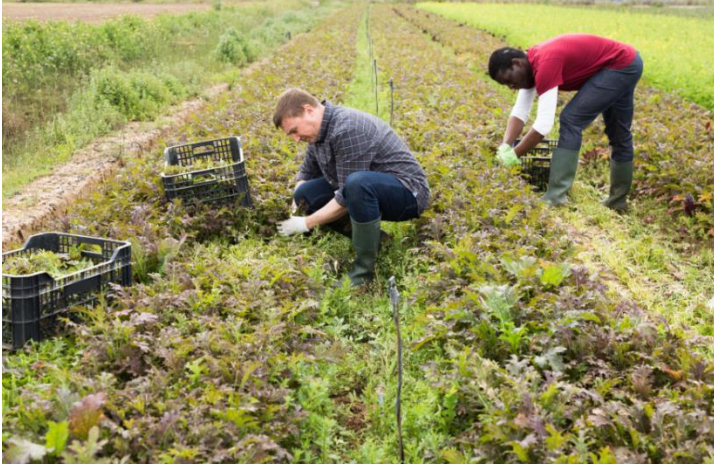
Fig: Hand Harvesting

1. Hand Harvesting/Manual Harvesting: Hand harvesting is a method of gathering grains, fruits, vegetables, leaves, etc., by hand or manually.