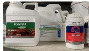
Farm & Home Chemicals | Southern Farm Supplies