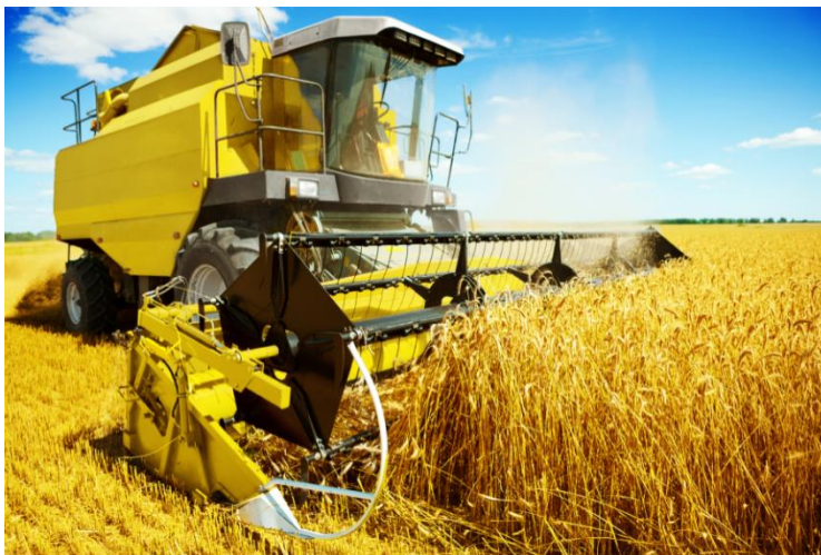
Fig: Harvesting with Machinery

3. Harvesting with Machinery: Machine harvesting is the act or process of harvesting grains in large quantities by using modern harvesters. A modern harvester can combine with other huge machinery to cut and clean the grains at the same time.