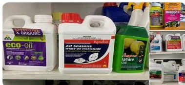
Farm & Home Chemicals - Southern Farm Supplies