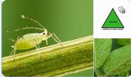
Aphids / Jassids - Cropservice