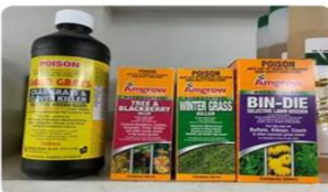
Farm & Home Chemicals | Southern Farm Supplies