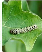
What Are Cutworms and How Do I Get Rid of Them? | The F...