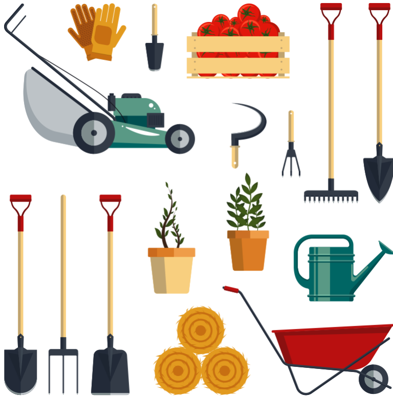
Fig: Hand Tools Used During Harvesting

3. Harvesting with Machinery: Machine harvesting is the act or process of harvesting grains in large quantities by using modern harvesters. A modern harvester can combine with other huge machinery to cut and clean the grains at the same time.