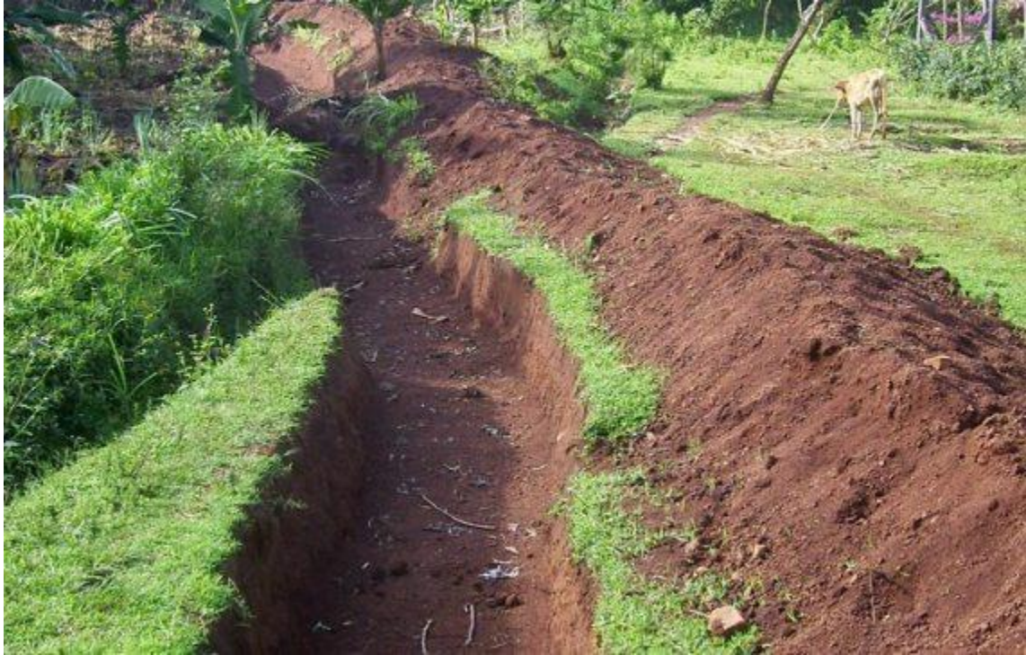
Example of 'Fanya juu' technique