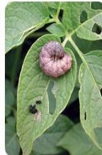
Variegated Cutworm - Potato - Ontario CropIP...