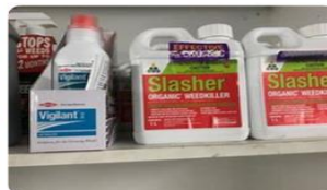
Farm & Home Chemicals - Southern Farm Supplies