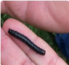
Mesquite Cut Worms - Bosque