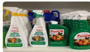
Farm & Home Chemicals - Southern Farm Supplies