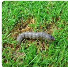
Managing Black Cutworms in Turfgrass