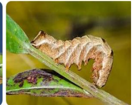
Cutworms: Identifying and Getting Rid of Cutworms