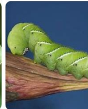
Cutworms in Dealing with Cutworms - Garden.org